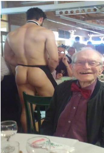
Cheek to Cheek....