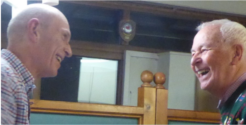
I wonder what the Joke was?