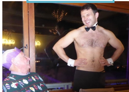
? Old Friends