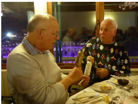
So much fun from a cracker