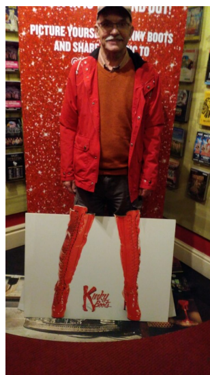
Like the boots!

We hope they will enjoy being members of GayWest.